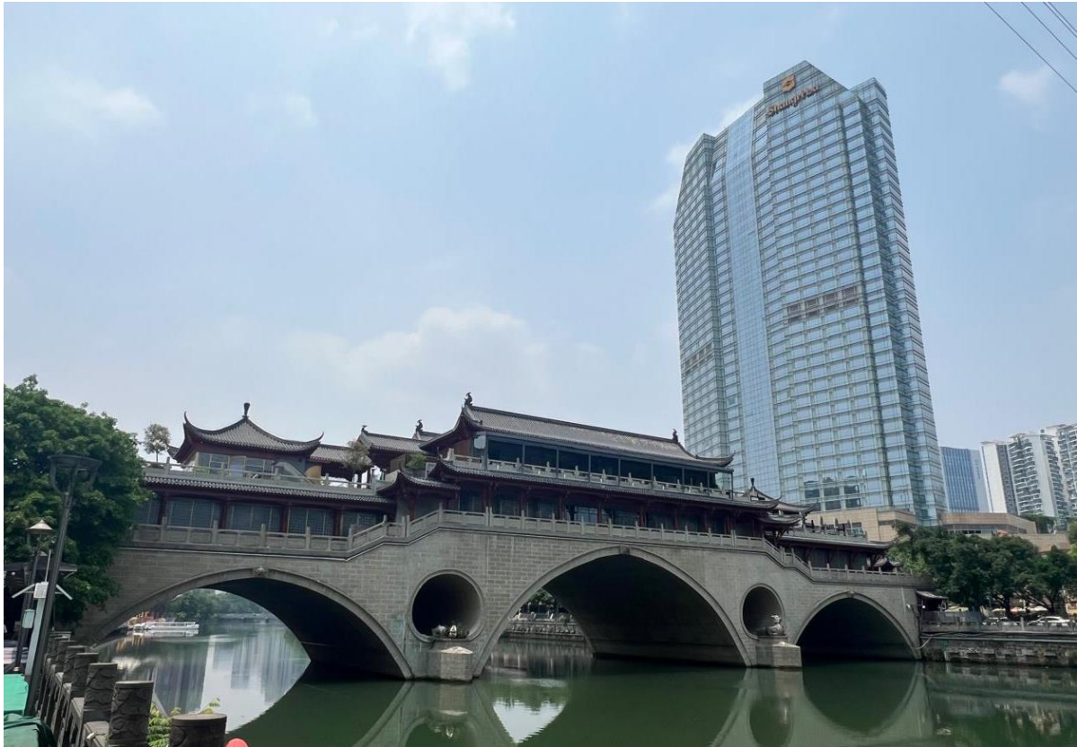
12- During the cultural visits in Chengdu, China