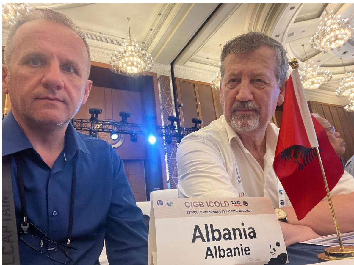
2- Albanian Team during the meeting of General Assembly of ICOLD, 2025