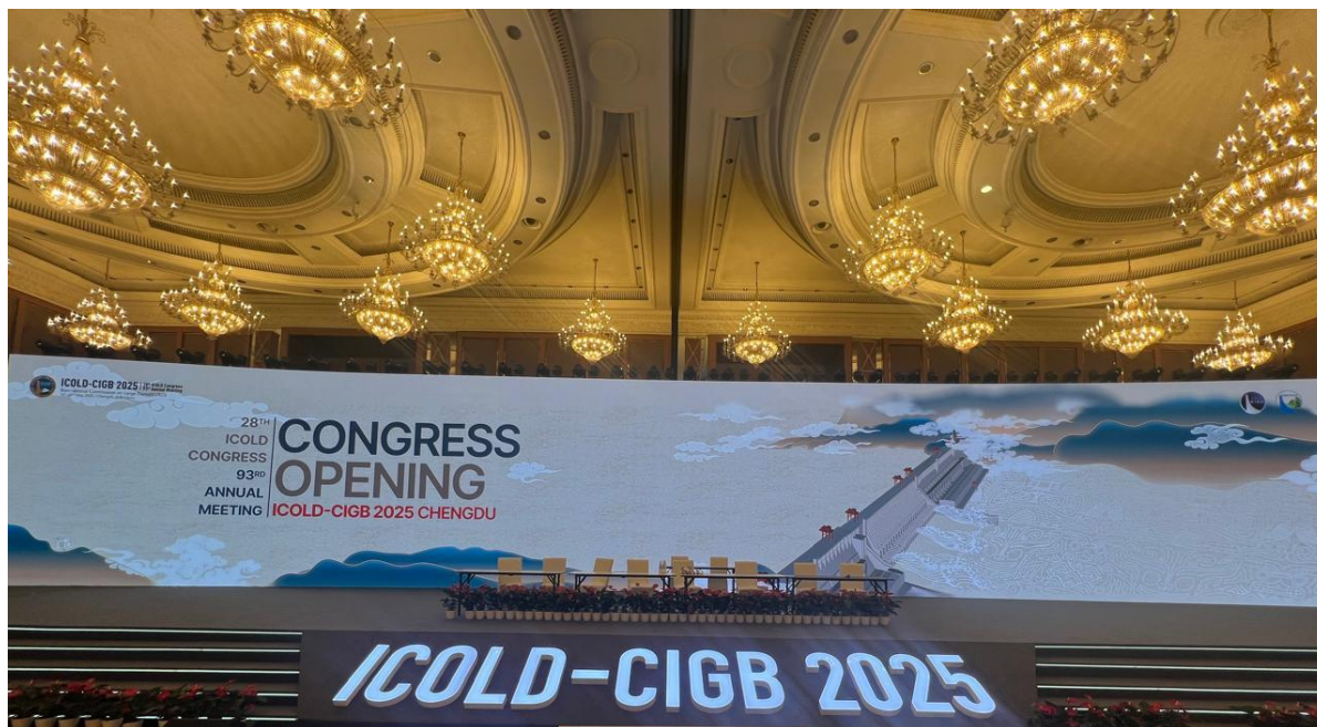
1- Main hall of 28 th ICOLD Congress, Chengdu, China, May 2025