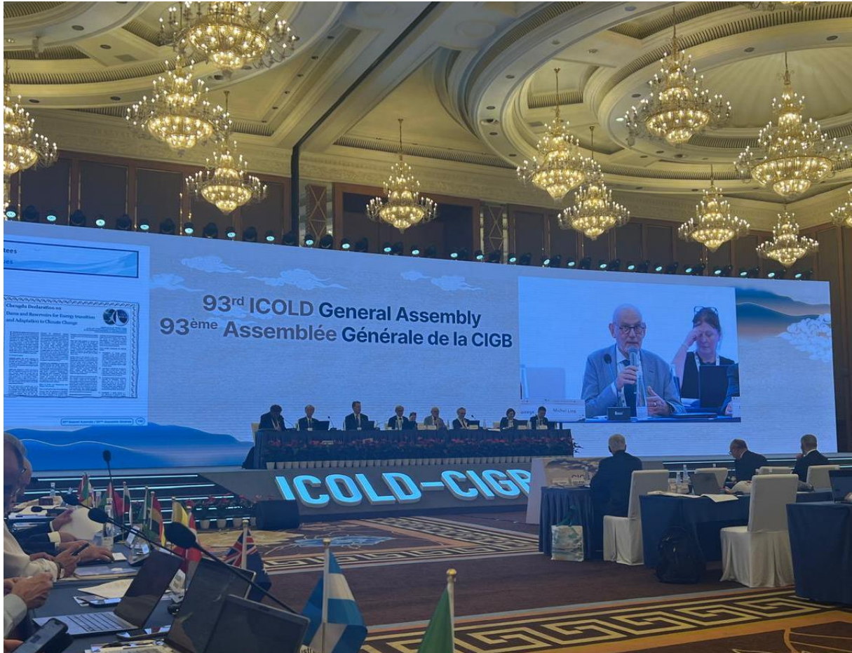
3- During the presentation of the ICOLD Declare on the Roles of Dams and Reservoirs in Energy Transition and Adaptation of Climate changes