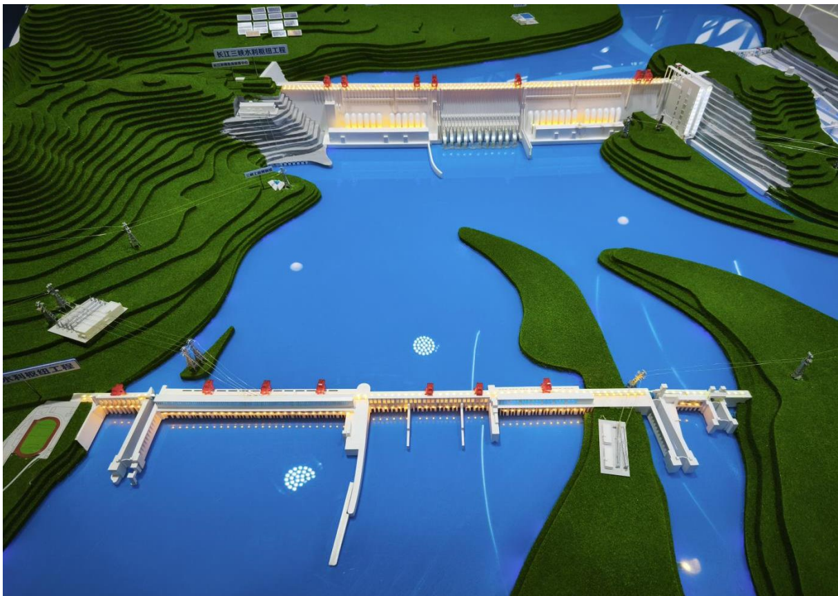
11- Model of Dam of HPP “ Three Georges” in China