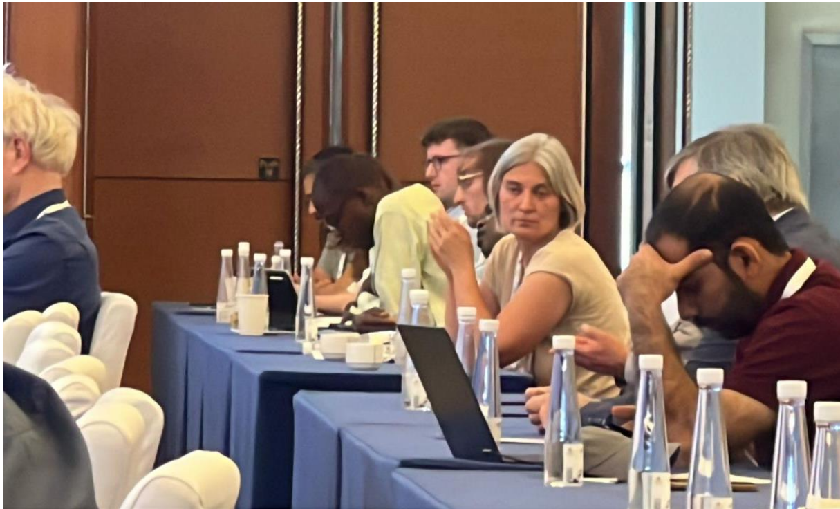
4- From meeting of General Assembly of ICOLD