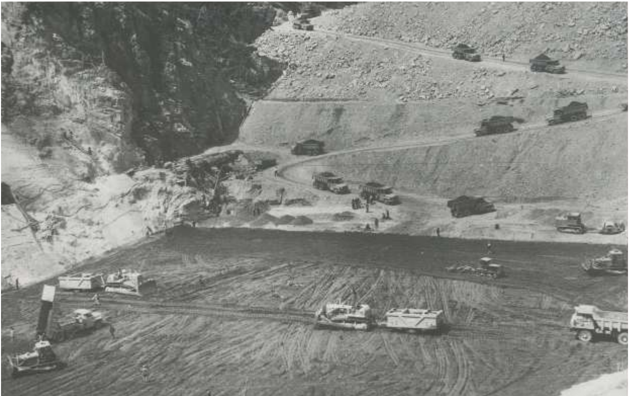
During the construction of clay core