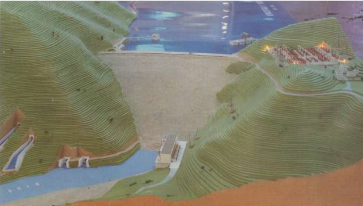
Physical Model of Fierza HEPP