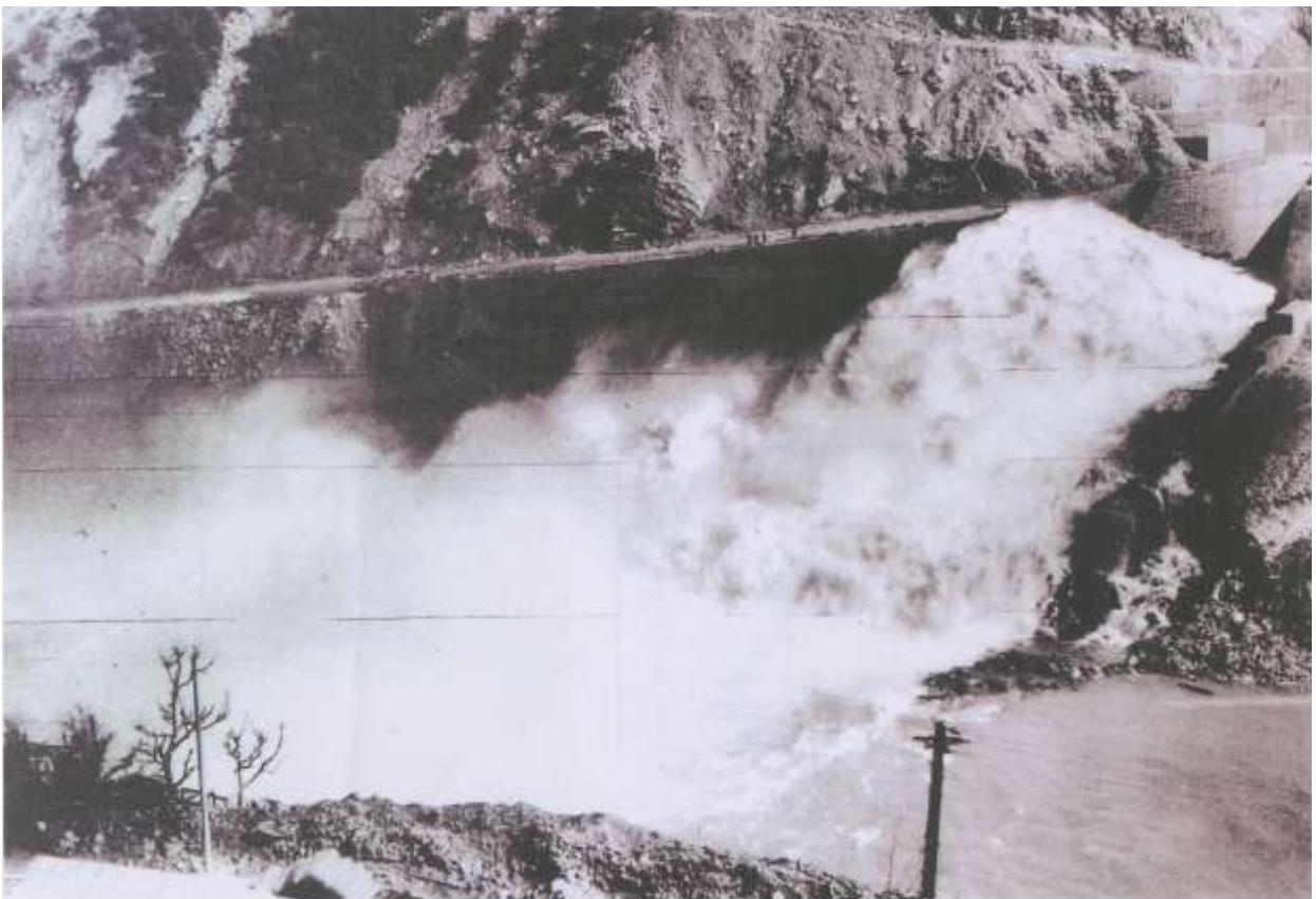
1978, Discharge of max flow from Spillway No. 3 during the construction,