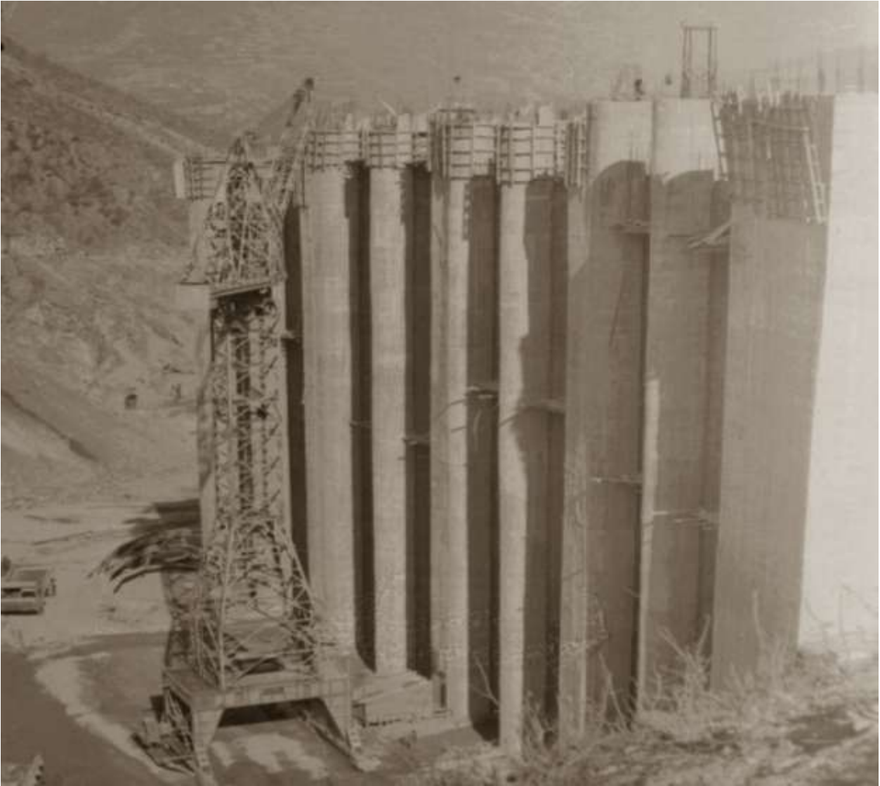
Construction of Intake