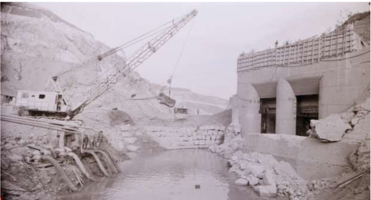
Construction of Spillway