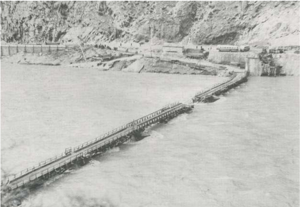
Temporary Bridge in the down stream of Fierza Dam